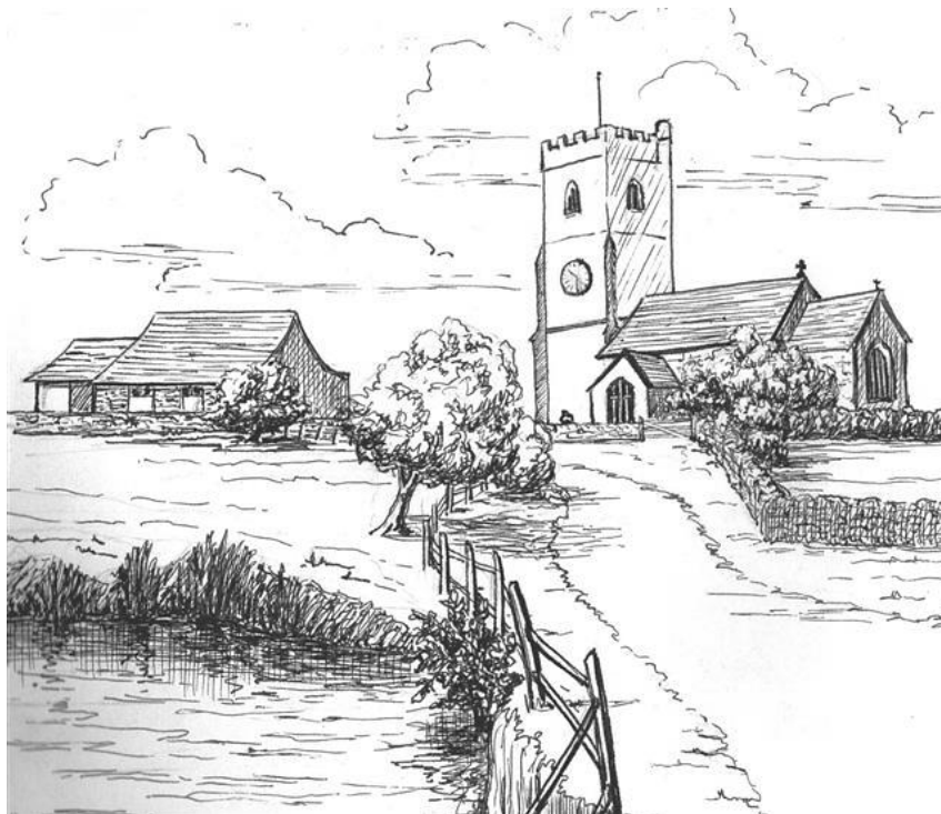
St Martin's Church, Fiddington

Description: A circular walk through pastureland and country lanes to the tranquil village of Fiddington. Grade - Easy