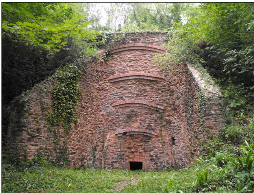
The lime kiln at Hawkridge Common

16. Carefully descend the steps through the woodland to re-join the trail and exit to the road. Turn right to re-join your car.